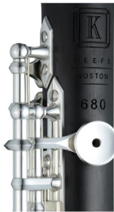
KEEFE PICCOLOS VENTED C KEY